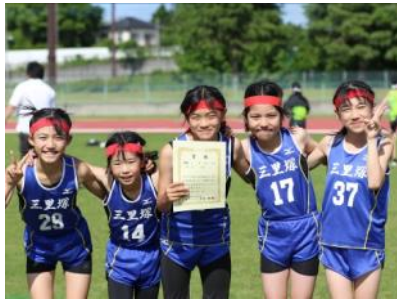
5th grade girls relay team