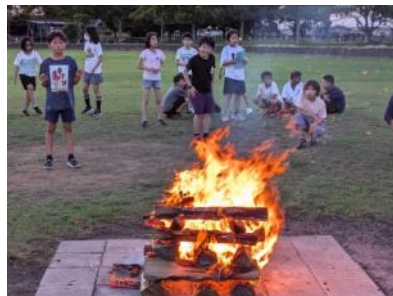
A huge campfire.