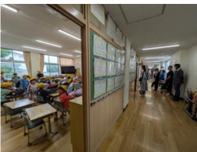
The brothers wait together in the classroom.