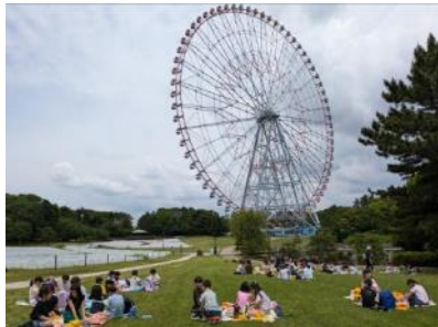
Lunch under the Ferris wheel