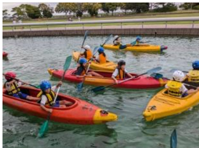
I can't control it!

The 5th graders went on an overnight study trip to the Omigawa Youth Nature Center. It was the first time for many of the children to stay away from home. The children had many experiences that they could not have at school, such as walking rallies, campfires, and canoeing.