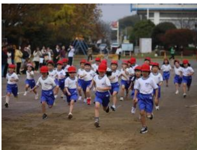
初めてのマラソン大会 一年生

The children participated in the Inba District Music Recital on behalf of the second division. The music club started practicing in the second semester. Section leaders were selected mainly from the sixth graders, and the leaders have been leading the practice. For the final performance, their goal was "Sing happily for yourself," and their beautiful voices filled the venue.