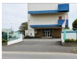
Employee gate (front) Car only

Normally, children and guardians do not use.