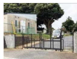
Back gate (Gakudo side)

It must not be used for picking up and dropping off children or when the gymnasium is open to the public. (Excluding pick-ups due to sickness etc.)