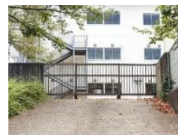
Employee gate (back) Car only

Only for walking and bicycles. Car traffic is prohibited.