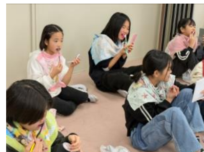
鏡を見ながら汚れを磨き落とします